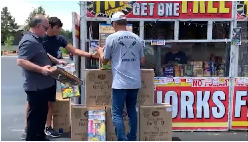
If anyone wants to help us raise funds you can donate here. CLICK HERE